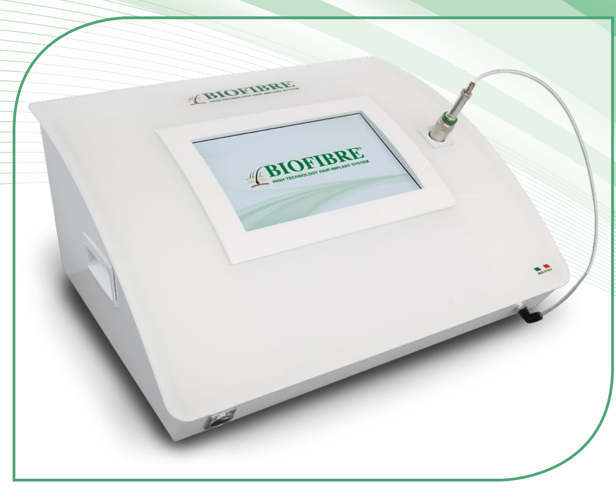
Soft surgery for baldness solution