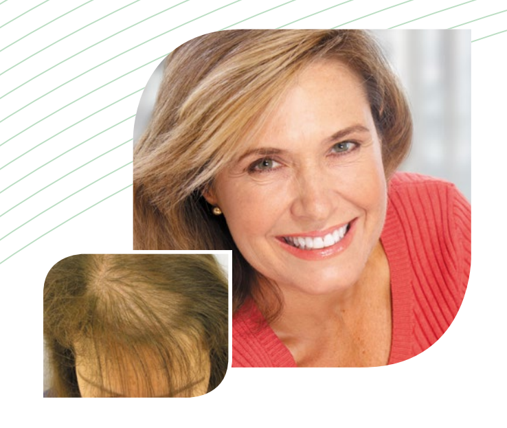
Large Quantity of Hair in a very short time